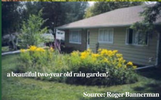
a beautiful two-year old rain garden!