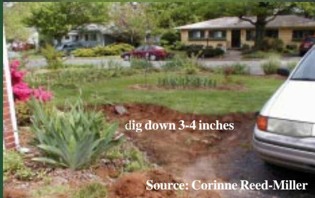
dig down 3-4 inches