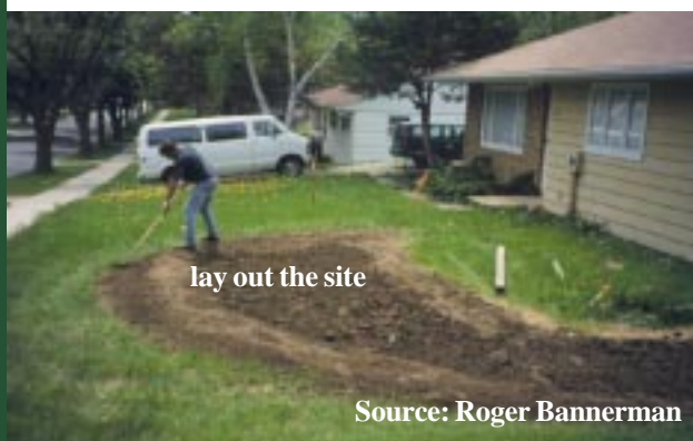
lay out the site

15 feet 15 feet 1/4 of the roof drains to one downspout = 15' x 15'