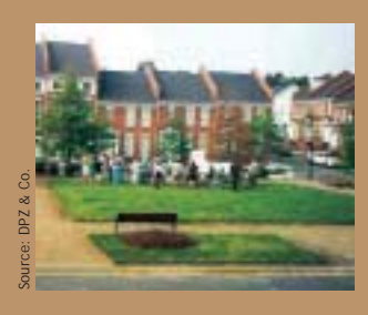
Bowman Park Vermillion Community Vermillion, NC