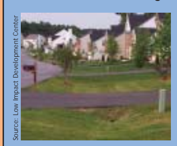
Grassed Swales Somerset Development Prince George's County, MD