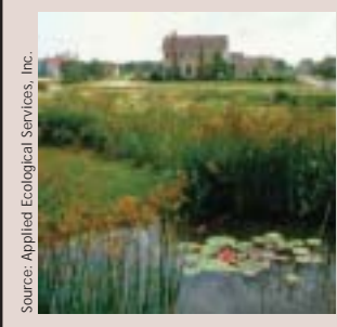
Wetland System Prairie Crossing Grayslake, IL